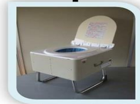
The number of times of continuous use About 200 times