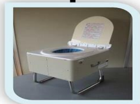
Engine halt condition The number of times of continuous use About 60 times